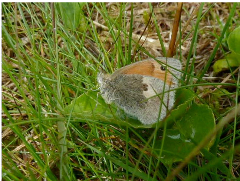
Small heath butterfly