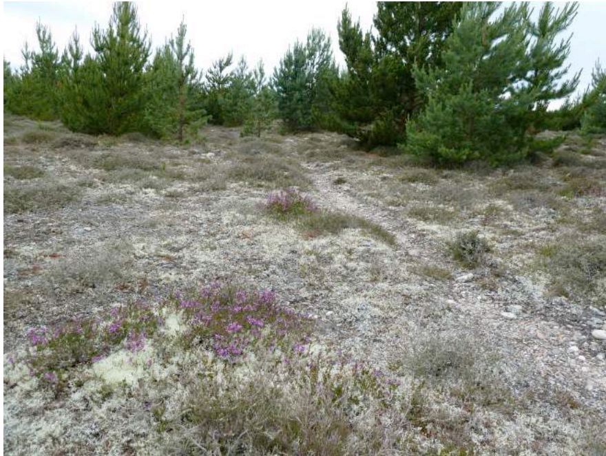
Dune heath, with encroaching pine trees

The best lichen areas within the FHT managed area were mapped by the Trust's local lichen expert in 2018. These areas are the first priority for restoration, by removing encroaching gorse and trees. Removal of gorse and trees from within lichen beds is best done using hand and power tools, either by volunteer work parties, or local contractors.