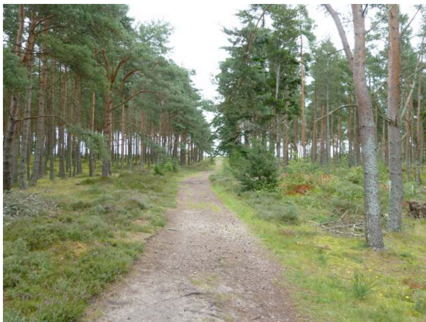
Main path through Wilkies Wood

left to decay naturally on the ground is continued over the next five years, and that some trees are identified that will be allowed to grow old, die and decay naturally.