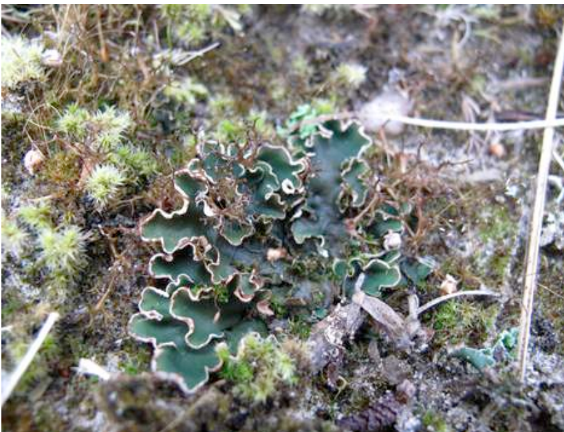
Matt felt lichen