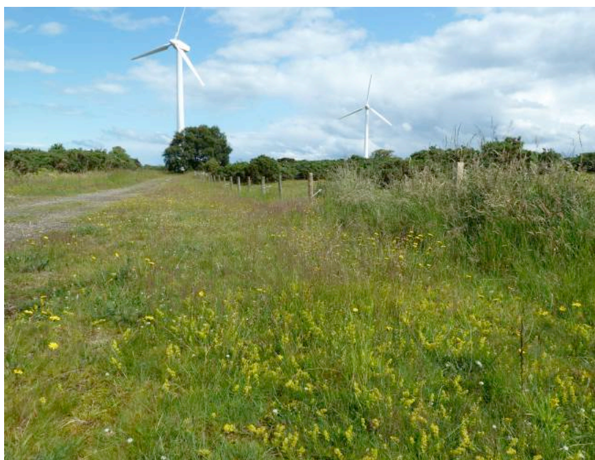
Species-rich grassland at the wind turbines

The grassland on FHT managed land contains a variety of wildflowers, which in turn provide food for Scottish Biodiversity List (SBL) and UK BAP birds, such as the yellowhammer Emberiza citronella and linnet Linaria cannabina , and insects such as the small heath butterfly Coenonympha pamphilus , and an impressive fifteen SBL moth species (Appendix 1).