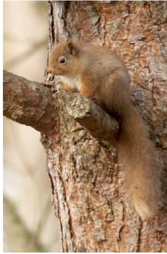
Red squirrel D. Devonport

Red squirrels live in a range of woodland habitats; in Scotland they are mainly associated with coniferous woodland. The kind of trees and how well connected they are is very important, as squirrels rely on their immediate surroundings for both food and shelter. In general, red squirrels fare better in areas with a variety of tree species. This is due to the seeding patterns of trees. Most tree species have years when an abundance of seeds are produced (mast crops) followed by years with average or poor seeding. Different tree species do not mast in the same years and a good year for one species of tree can be a poor year for another, so that woodland composed of a mixture of species provides a more dependable supply of seed food. While tree seeds are the staple foods, red squirrels also eat fruits, tree shoots, buds, bark, fungi, lichens, song bird eggs and chicks and insects.