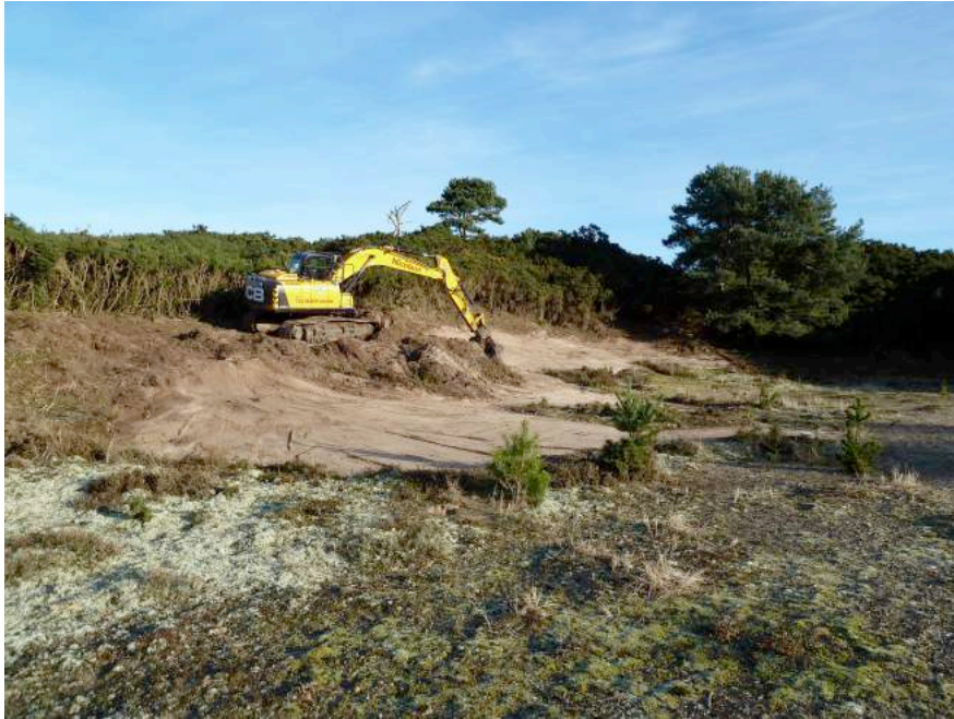
Stripping brash and humus